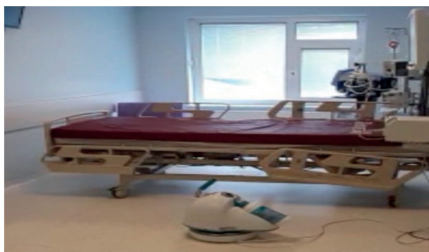
Figure 2. Hydrogen peroxide application in a patient room.