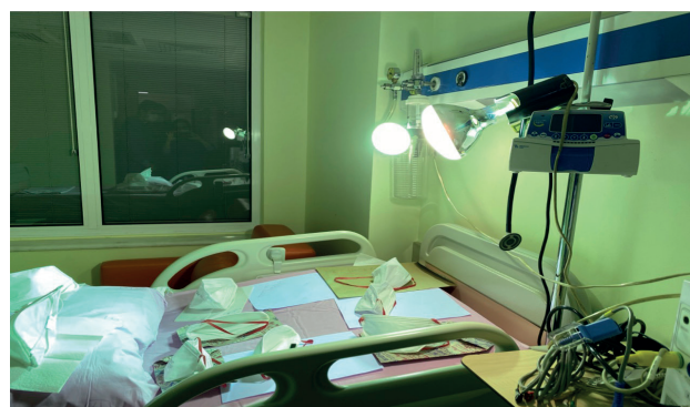
Figure 3. Respirators in a room under UV light between usages.

We diagnosed suspected cases, according to our national COVID-19 guidelines. Criteria was changed intermittently by the Coronavirus Scientific Advisory Board in Turkey in response to new data