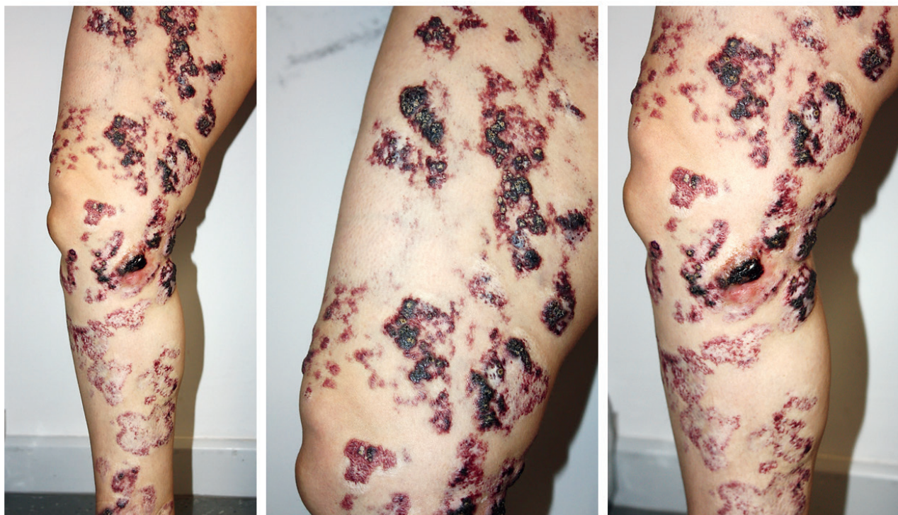
Figure 1. Multiple, violaceous to black, verrucous plaques and nodules of variables sizes accompanied by hyperkeratinization are present on the entire right thigh and leg. Some plaques on the right leg were excised and skin grafting was applied.

VVM, also known as verrucous hemangioma, is a rare congenital vascular malformation which is usually localized to the lower extremity, unilaterally [2]. Even though, VVM has an immune profile analogous to the vascular proliferations; it exhibits histopathological features, clinical behavior and evolution pattern of vascular malformations [2,3]. VVM is present at birth or appears during early childhood, in the form unilateral, localized or grouped, erythematous patches which eventually transform into hyperkeratotic, confluent, dark